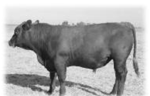
MCPHEE SPOTLIGHT 204