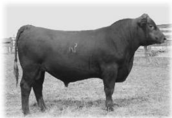
MCPHEE R LEGACY 5105