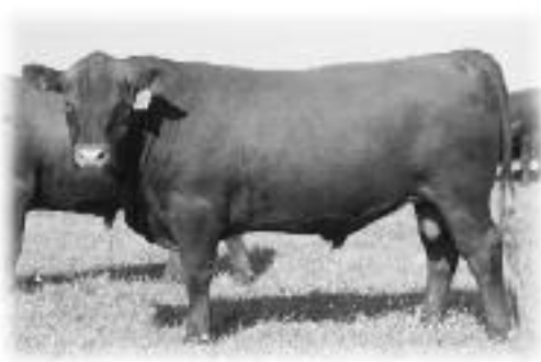
MCPHEE HOT ONE 5108