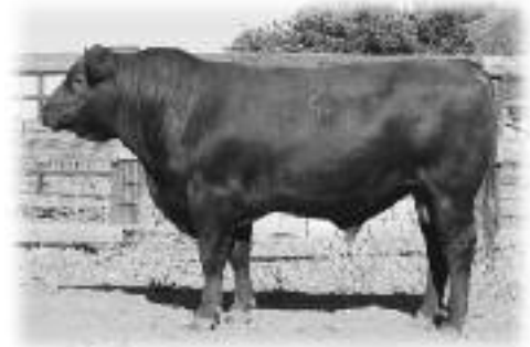
MCPHEE TWICE AS GOOD 166