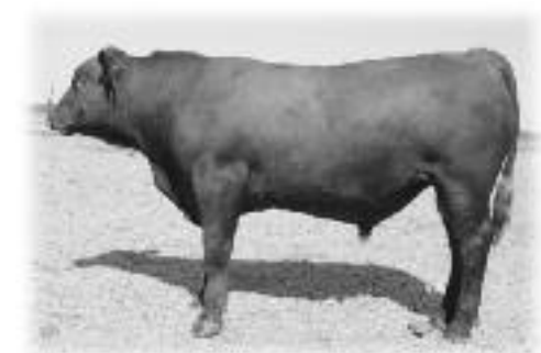
MCPHEE R DYNAMIC 207

EPD Averages for Non-Parents Under Two Years of Age