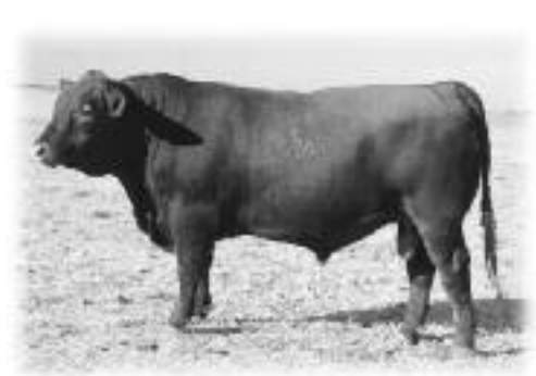
MCPHEE IRON MAN 5090