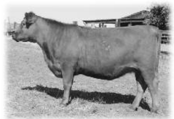
ROYCE'S DREAM GIRL 168

Pregchecked bred 3 months on 7/20/23 to reference sire F