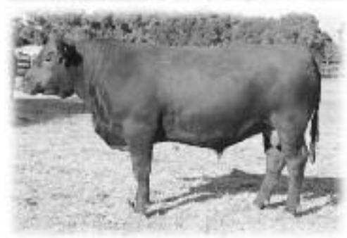
MCPHEE THE CHOICE 532