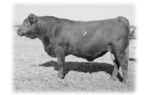
MCPHEE R PAYWEIGHT 206