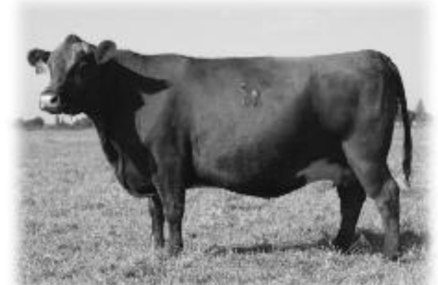
MCPHEE POWER GIRL 5406

Pregchecked bred 4 months on 5/18/23 to sire E