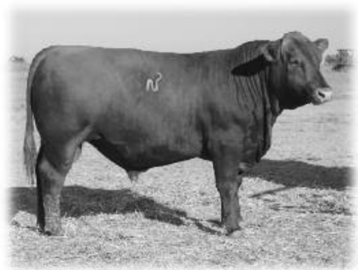
MCPHEE SMART BET 5095

This boy has worlds of style and muscle and is thickly made and stout. He posts a -2.5 BW EPD for sleep-all-night calving ease. You have to admire the length of body on this bull. He has a whole lot of performance and style on a moderate frame. He ranks in the top 10% of the breed for seven relevant traits, including ADG EPD ranking of top 4% of the breed.