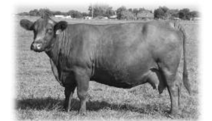
MCPHEE REAL SWEET 5246