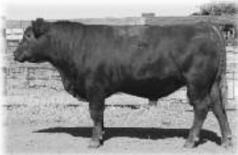
ROSE'S RED DUDE 190