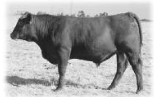
MCPHEE PAYDAY 529