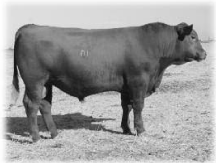
MCPHEE BLAZING HOT 172

8 MCPHEE BLAZING HOT 172 Tattoo:172 Birth: 8/2/22 REG#:4785778 CAT:A 100% AR