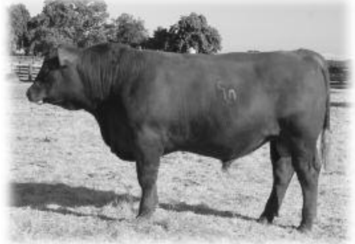
MCPHEE FIRST CLASS 175

This moderate-framed bull is loaded with muscle and style. He is a real body builder. His EPDs are impressive all the way from a -1.1 BW EPD to a 76 WW EPD and a 119 YW EPD, with a Marb EPD ranking in the top 2% of the breed. He has a royal pedigree, as well as breed-leading performance and eye appeal. His dam posts an impressive MPPA of 103. Don't pass him up.