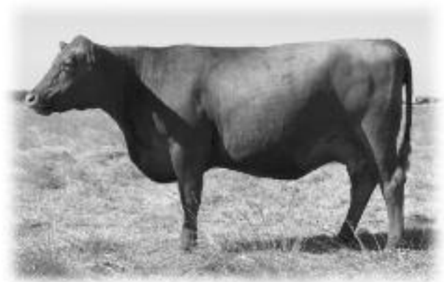
MCPHEE EYE CANDY 5513

Pregchecked bred 4 months on 5/18/23 to sire E