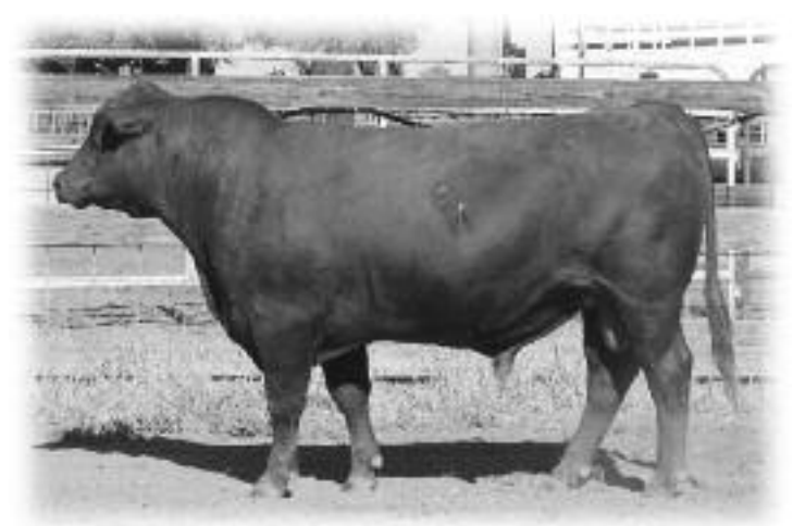
MCPHEE RIGHT CHOICE 200

One of our up and coming young herdsires working the pastures. He offers superior carcass traits scanning a 4.4 marbling with a 132 ratio. That is a trait that he will certainly pass on to his progeny and collect the premiums at harvest. Dynamic is just as impressive to look at, as he is long bodied deep ribbed and sound as a cat.