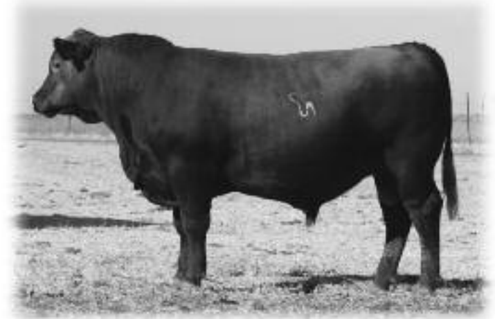
MCPHEE MAGNUM 5109

This son of Flatiron Precision 643 has a great suite of EPDs including growth and carcass traits. He is well balanced on a moderate frame and loaded with red meat. McPhee Magnum 5109's dam has outstanding performance and carcass EPDs herself, ranking in the top 10 of the breed for seven traits. His ADG EPD ranks him in the top 1% and his Marb EPD ranks in the top 4%. With just a 74-lb. BW, this calving ease bull will produce calves that will crush down the scale come sale time.