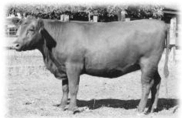
ROSE'S DON'T FORGET 182

Pregchecked bred 4 months on 7/20/23 to reference sire F