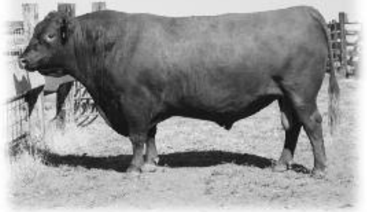
MCPHEE DONE GOOD 4960

A herdsire that impresses us with each calf crop. He is good himself and backs it up with the performance he stamps on his calves. McPhee Done Good has a great balance to his suite of EPDs and offers a little something all across the board. He is a very stylish sound footed bull to lay your eyes on. We couldn't be more pleased with what he has done and are excited with him in our pastures breeding cows. Done Good is out of a McPhee Trophy 36 daughter.