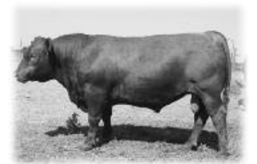
MCPHEE FIRST DOWN 5103