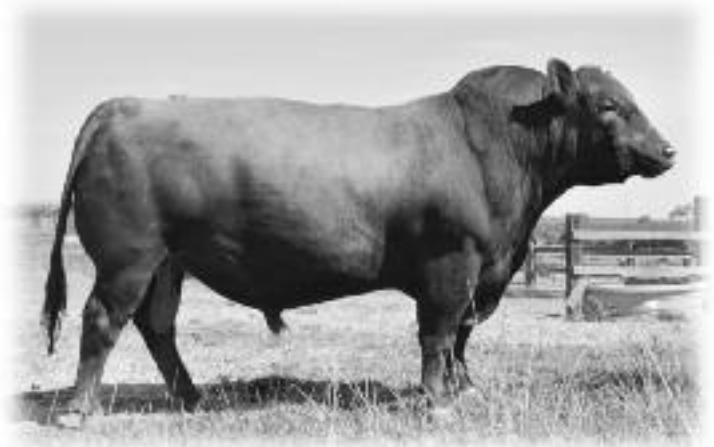
FLATIRON PRECISION 643

This is a herdsire that offers everything you will need to collect the extra premiums at market time, especially with an ADG EPD ranking in the top 2% of the breed. When calves are sold by the pound, this sire can add pounds to your calf crop at weaning. Over half his EPDs rank in the top 20% of the breed including BW and top 10% for YW, he is a curve bender that puts money in your pockets. He is loaded with muscle and great conformation. He has tremendous eye appeal and is one that has a healthy libido. His nickname is playboy as he is always looking for the next female in heat. We have used him on heifers and cows alike with tremendous success. We selected Flatiron Precision as our choice from all the Red Angus bulls in the 2017 National Western Sale in Denver.