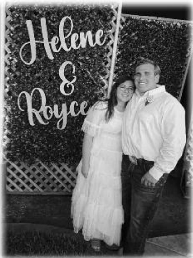
Joining the family