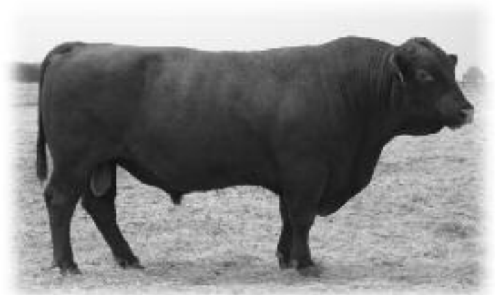
ROYCE SENSATIONAL COMMIT 63

Is our ET son out of the famed Royce's Sensational cow. He is one to get your attention with his thickness and eye appeal. He was the high indexing and selling Red Angus bull at the 2017 Midland Bull Test in Montana selling to Hathaway Red Angus. After having regrets of letting him go, we were able to work out a partnership, and he found his way home. He has it all, calving ease and growth and carcass quality, all highly heritable traits that he has passes on to his calves. Coming from one of the best cow families in the breed he offers a unique combination of maternal and terminal performance to add value in your calf crop. Your opportunity to get in on this performance is through these sired calves and his semen is not on the open market.