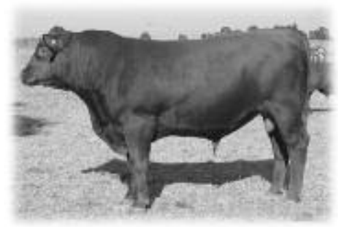
MCPHEE BIG DEAL 528