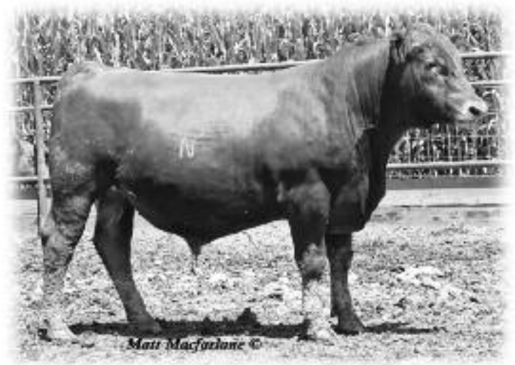
MCPHEE DARN GOOD 4535