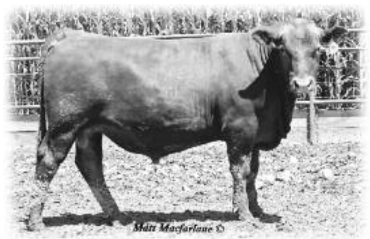
MCPHEE HESA STANDOUT 39