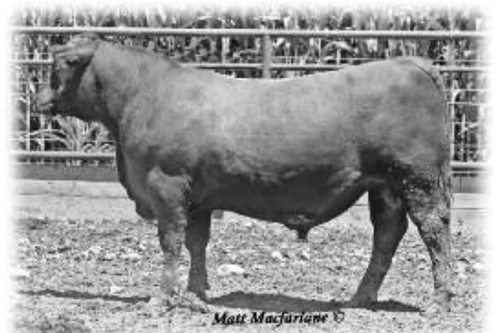
MCPHEE PACIFIC KING 376

McPhee CountryBoy 378 is a handsome, high growth bull with calving ease. What a great combination. CountryBoy has just a 75 # BW but a 805 AWW with a 127 ratio. This is a powerfully made bull that your heifers and you will love. His WW and YW EPD's rank in the top 3% of the breed. This bull was shown this summer and was named Reserve Supreme Champion Bull for Royce. He is sure to be your favorite. Retaining 25% semen interest.