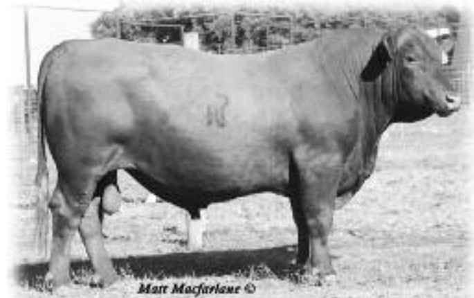
McPhee Top Commitment 352

McPhee Top Commitment 352 is an up and coming star in the breed. He ranks in the top 5% or better of the breed for WW, YW, STAY, MARB, and CW EPD's. He also holds the rank of the #1 MARBLING/GROWTH bull in the entire breed. This is a sire that bends the curve and does it well. We are just about ready to wean his first calf crop, and they are an impressive set of calves. We are giving two straws of semen on McPhee Top Commitment 352 with every heifer purchase. SEMEN AVAILABLE