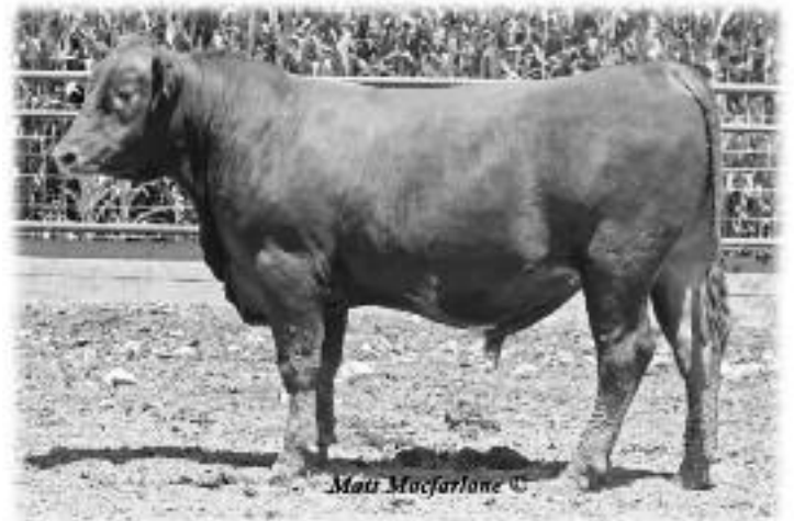
MCPHEE PACIFIC JUSTICE 34

McPhee Pacific Top 4587 has lots of volume and thickness and looks just like his sire, Pacific Pride. Look at those growth and carcass traits! All with a modest birth and a 117 ratio for weaning. His actual off test weight was 1360 pounds. His WW ranks in the top 1% and REA in the top 2%. His young dam's pedigree stacks maternal and calving ease traits with a 105.6 MPPA. Your calves will mash down the scales. Take a look at that great set of EPD's. Pacific Top has curve bending genetics. Retaining 25% semen interest.