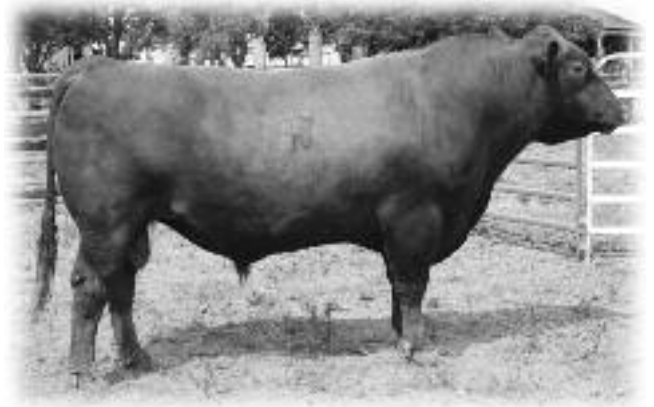
Oak Ridge Mission Statement Service Sire For Bred Heifers