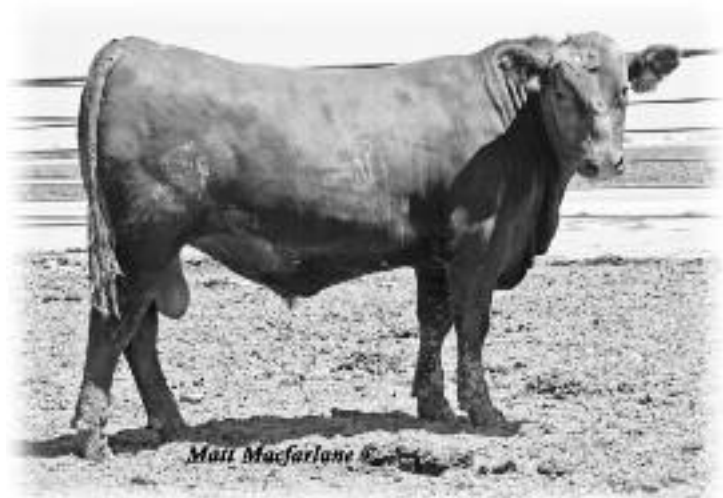
MCPHEE MADE GOOD 4559