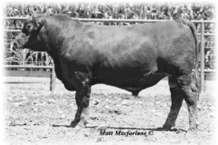
MCPHEE R MISSION 4550

McPhee R Mission 4550 has a superb balance of the growth traits. He starts off with a 70 pound BW and finishes in the top 4% and 1% for WW and YW. Look at that 100 YW EPD ! What an amazing EPD profile. R Mission 4550 catches your eye out in the pen. He is dark red and very handsome. He has loads of thickness, volume and fleshing ability. His pedigree combines that rare combination of calving ease and high growth. There is lots of potential in this bull. Retaining 25% semen interest.