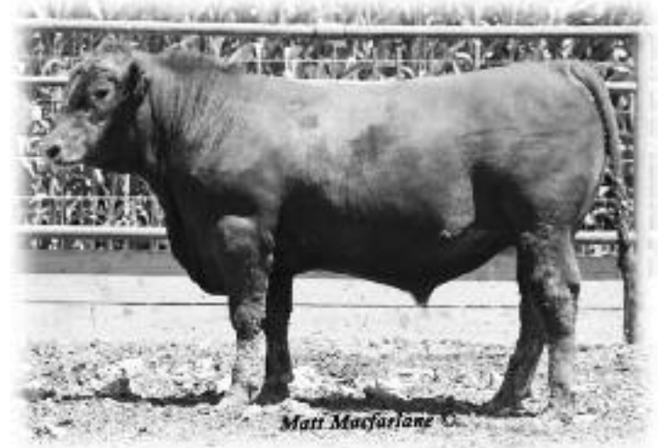
MCPHEE HIGH PRAISE 377

McPhee High Praise 377 has a heavenly pedigree. He loads performance and carcass on the top side, and his dam is a daughter of on of the most popular sire's of the breed-Major League. Greatness runs deep in his pedigree. You'll sleep good at night when your heifers are calving with his -2.7 B EPD and actual BW of just 70 pounds. This bull is deep and wide and really attractive. He is easy to love. Retaining 25% semen interest.