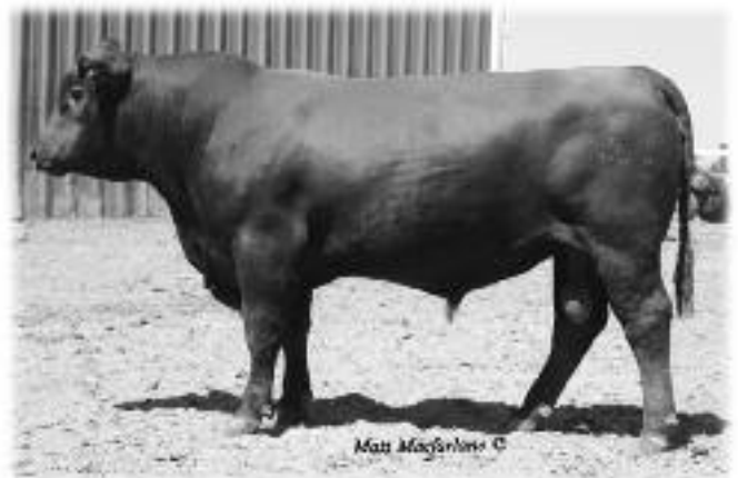
McPhee Pot of Gold 3991

McPhee Pot Of Gold 3991 is a herdsire who does it all right. From his proven calving ease to his growth, and carcass make him the ideal choice. He has one of the most balanced set of EPD's you will find. With loads of expression of muscle and correctness, he does this all in a moderate frame. He has given us some of the best females we have ever raised. His daughters make great mothers and are easy fleshing, without sacrificing feeding their calves. Pot of Gold is a maternal brother to Pacific Pride and we are benefiting from the maternal traits these bulls bring to the table. A sire that just gets better with each calf crop on the ground is a rarity, but at McPhee Red Angus it is a reality. SEMEN AVAILABLE