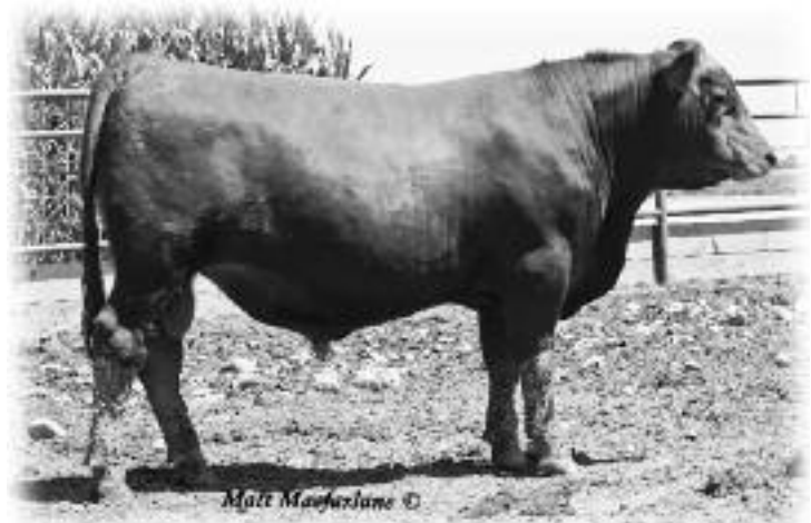
MCPHEE RIGHT KIND 4564