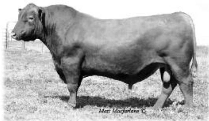
McPhee Pacific Pride 4127

DZA Joe Maker 705 a sire we are extremely proud of. He ranks in the top 25% in the breed for WW, YW, MILK, and TM EPD's and top 2% for MARB and top 4% for REA EPD's. He sires calves that are thick and attractive. They are cattle that rise to the top of the pen. You can count on them being top gainers and when you get down to the carcass they shine their too. It's sometimes tough using a new sire in a program, a lot of what if's. Well Joe Maker has taken the guess work out of that. His calves have performed above the bar and we are confident that he is a true asset in our herd. We look forward to his daughters in production this year. SEMEN AVAILABLE