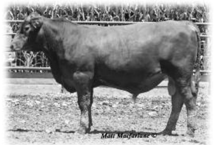
MCPHEE DOMINATOR 4548