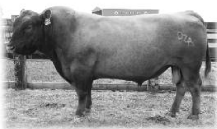
DZA Joe Maker 705

better and averaged a 12.3 inch REA. So we are very proud of Prides influence. Let McPhee Pacific Pride influence your herd, it is influence you can put in the bank. SEMEN AVAILABLE THROUGH ABS GLOBAL